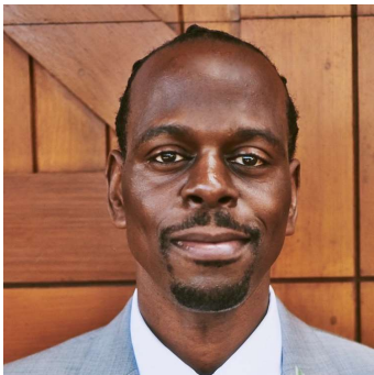
Writer Guest of Honor – P. Djèlí Clark

We are thrilled to announce our guest of honor lineup for Norwescon 45!